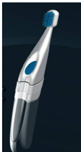
Breath Blaster™, depicted above, with the clear cover attached to the bottom unit to form a full-length toothbrush.